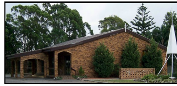
Our Lady Help of Christians Church Mallabula