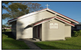
St. Christopher's Church Medowie