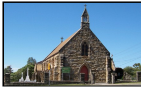
St. Brigid's Church Raymond Terrace