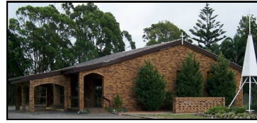
Our Lady Help of Christians Church Mallabula