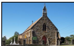
St. Brigid's Church Raymond Terrace