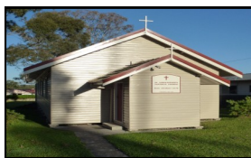
St. Christopher's Church Medowie