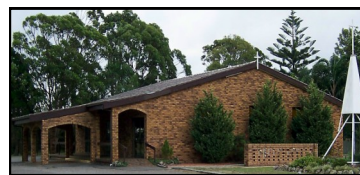
Our Lady Help of Christians Church Mallabula