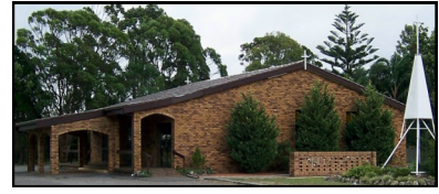
Our Lady Help of Christians Church Mallabula