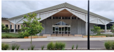
St. Christopher's Oratory Medowie