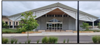
St. Christopher's Oratory Medowie