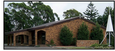
Our Lady Help of Christians Church Mallabula