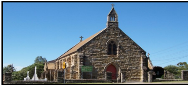
St. Brigid's Church Raymond Terrace