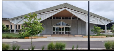
St. Christopher's Oratory Medowie