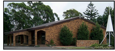
Our Lady Help of Christians Church Mallabula