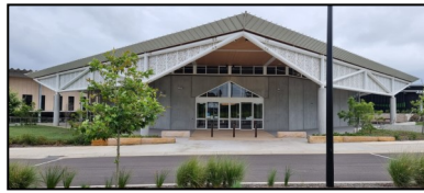
St. Christopher's Oratory Medowie