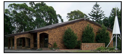
Our Lady Help of Christians Church Mallabula