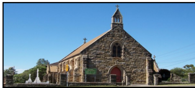
St. Brigid's Church Raymond Terrace