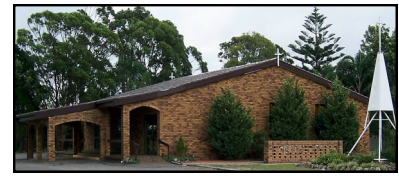
Our Lady Help of Christians Church Mallabula